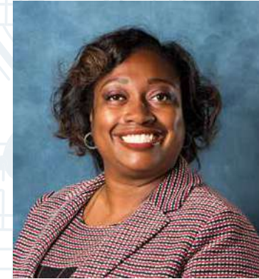
COTENA P. ALEXANDER OFFICE OF TRANSPORTATION INFRASTRUCTURE MANAGEMENT DEPUTY COMMISSIONER